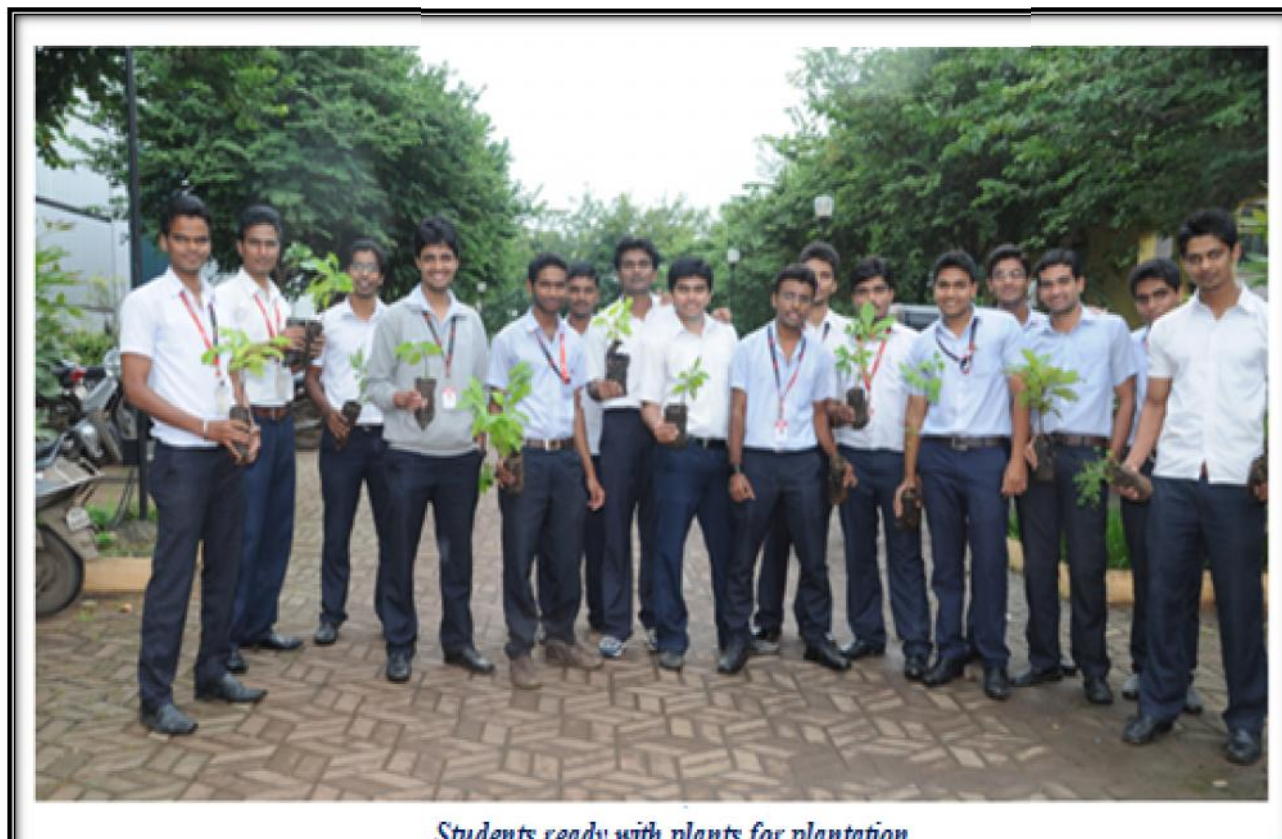
Students ready with plants for plantation