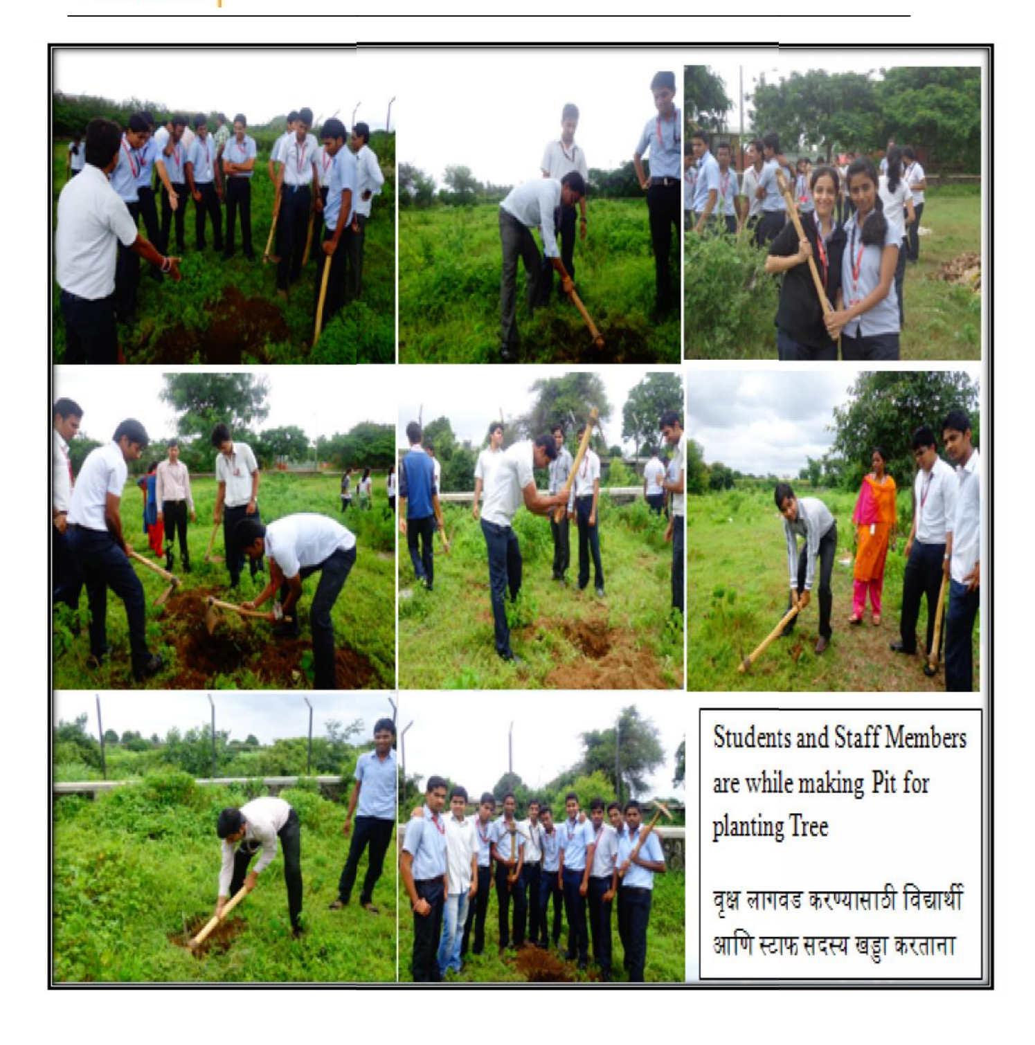
The endless efforts are taken by students and staff to success this activity; and it gives a message to the society the importance of trees in life and nature.